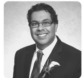
His Worship Mayor Naheed Nenshi City of Calgary

"[This program] made us all feel a sense peace knowing we didn't need to stress about money for those extra things. My kids also seem to be [prouder] of Mom because she was able to give them something they wouldn't normally get."