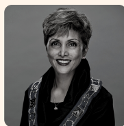
Her Worship Mayor Jyoti Gondek City of Calgary