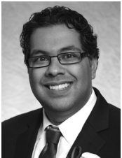
His Worship Mayor Naheed Nenshi City of Calgary