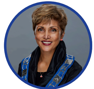
Mayor Jyoti Gondek City of Calgary